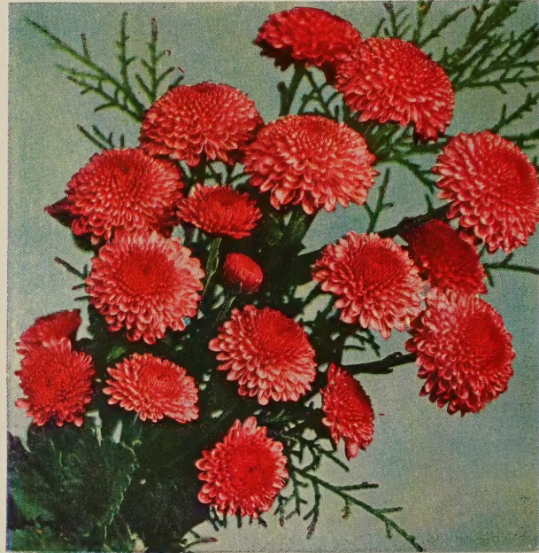
MASQUERADE. $1.00 each; 3 for $2.50